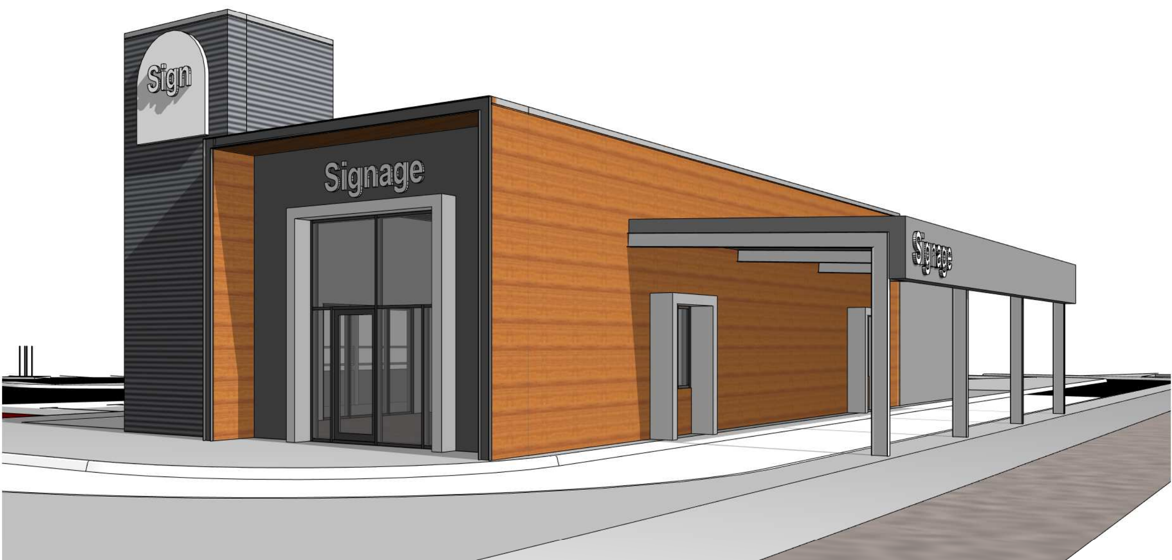
B1-2 VIEW FROM RANFORD ROAD (EAST)