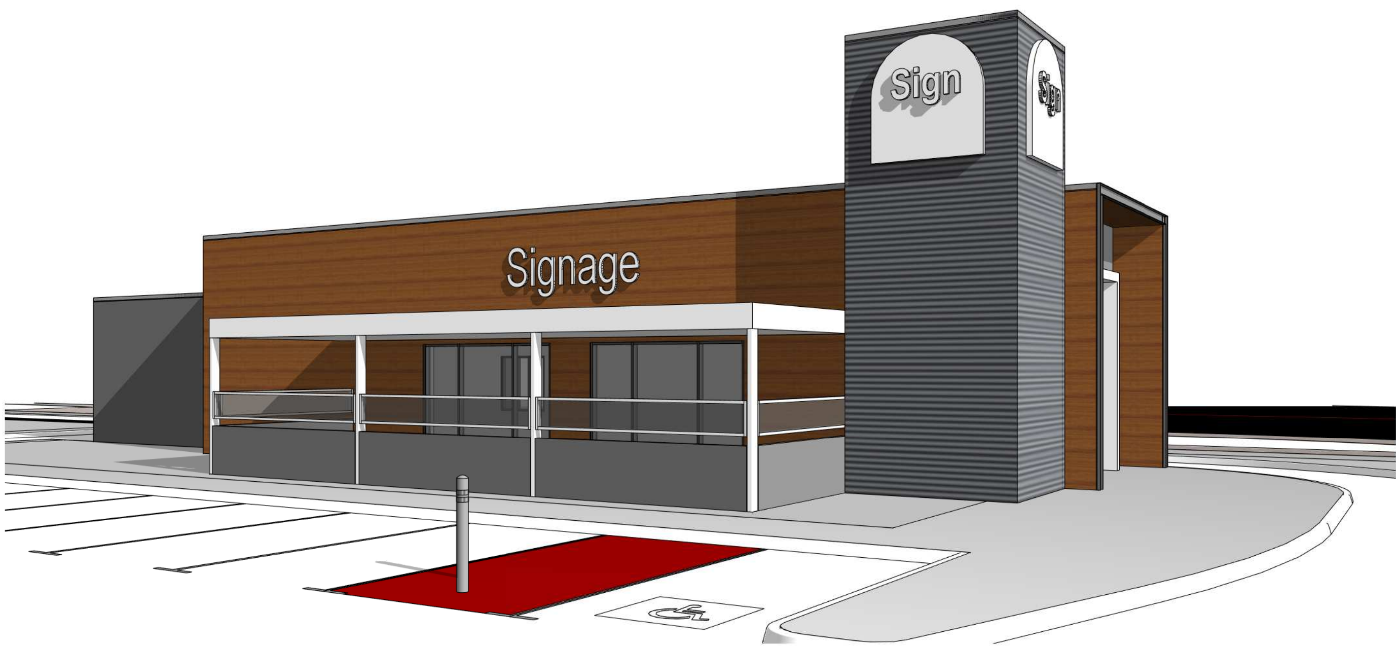
B1-1 VIEW FROM CAMPBELL ROAD (SOUTH)