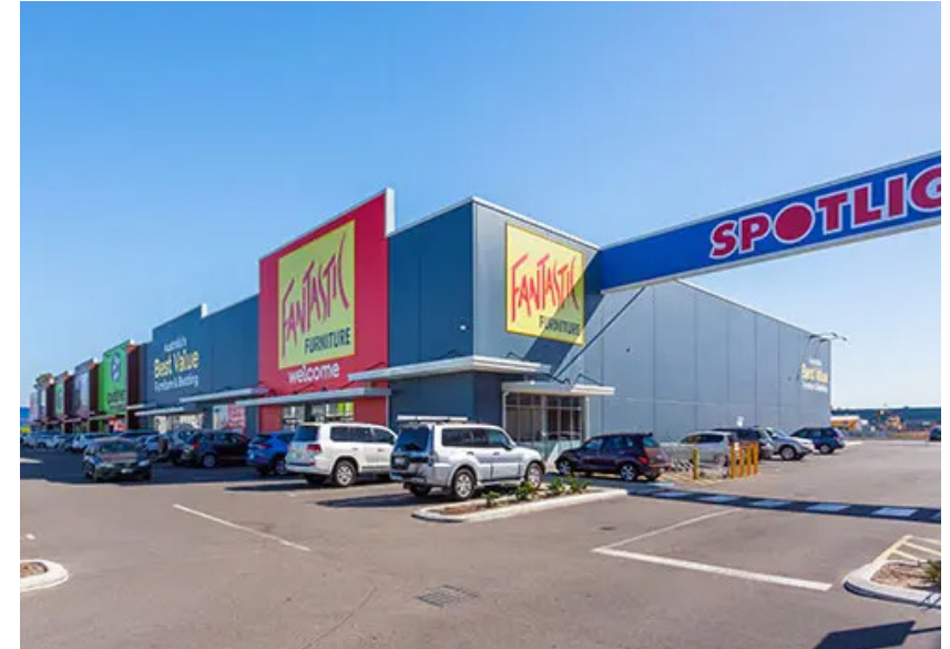
> 7 Clayton Road, Bellevue WA