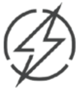
3 Phase Power