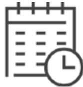
Move in Now!