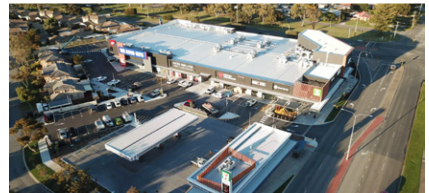
> Rockingham LFR Trust